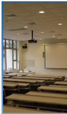
School/ Kindergarten/ Library