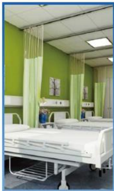
Hospital/ Exhibition hall