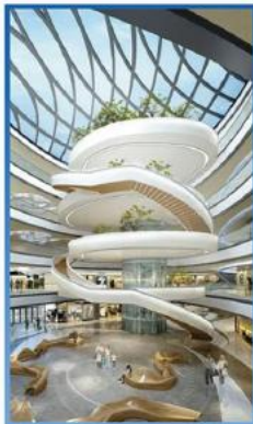
Office/ Mall/ Cinema