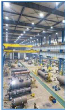
Factory/ Warehouse/ Dining hall