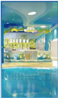
Indoor amusement park/Gymnasium